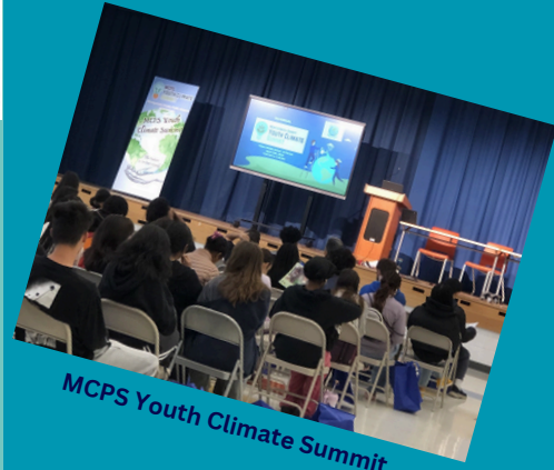
MCPS Youth Climate Summit