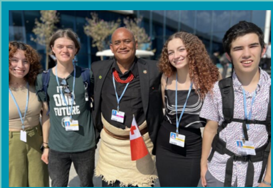
Students at UN Climate Change Conference

It's Our Future (IOF) is the youth program of Seven Generations Ahead , a Chicago area non-profit that supports sustainable communities and just climate solutions. IOF empowers students at over ten Chicagoland high schools to work together towards climate justice in their schools and communities.