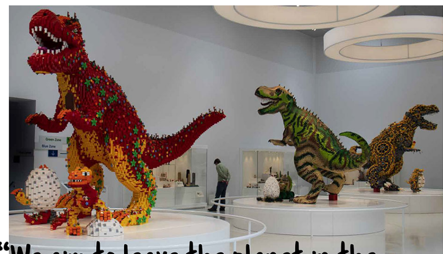
"We aim to leave the planet in the <sup>4</sup> IVENTING SOLITION best possible shape for kids." RELEE VAL DE PUL 47