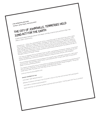
See sample press release on Page 13.