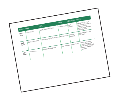
See sample media list on Page 11.

Press interest is key to building attendance and the attention of elected officials. Create a plan that includes top line messaging, a timeline for media relations, and begin drafting social media messaging.